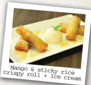
Mango & sticky rice crispy roll + Ice cream