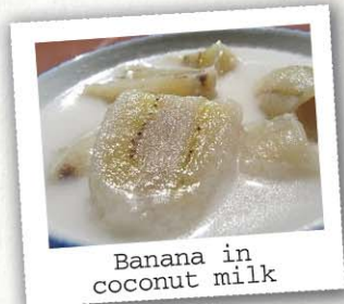
Banana in coconut milk