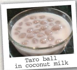
Taro ball in coconut milk