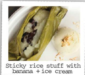
Sticky rice stuff with banana + ice cream